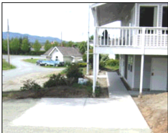
Man, have we got concrete!