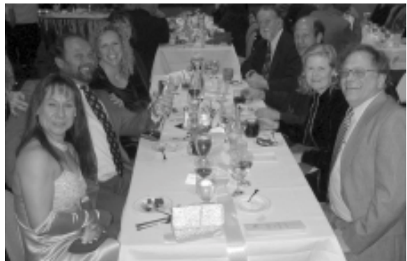
A good time was had by all!