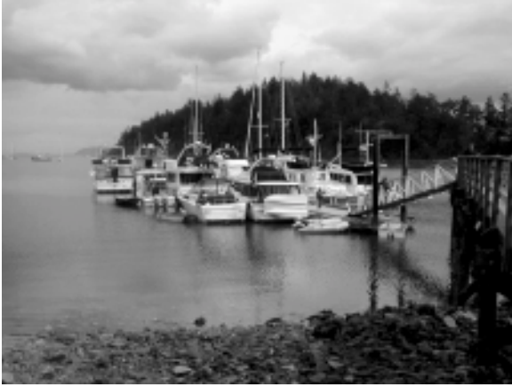
AYC Fleet at Sucia's Fossil Bay

Twenty boats gathered for another convivial cruise to Sucia Island on May 3-4. There were three boats on hand by May 1, Thursday, and several more on Friday. The early birds got the shirt-sleeve sunny weather.