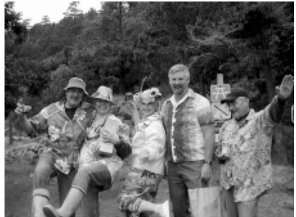
Sucia Cruise Hawaiian shirt contest