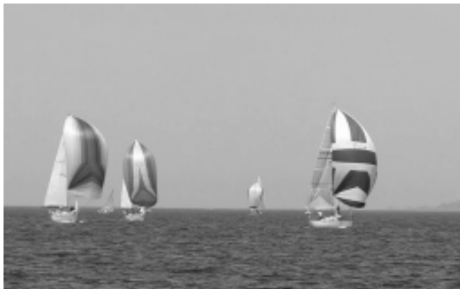
A perfect weekend of racing