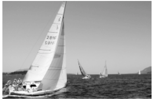
A J 29 heads for the windward mark