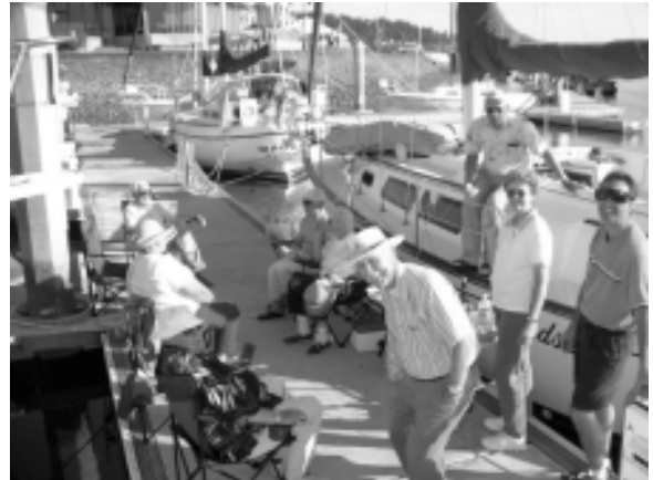
Gathering on the dock in Bellingham.

the evening, as the drivers bade farewell and the boaters went off for a walk to the Lost Fishermen memorial. If you haven't seen this, it's beautiful and moving, and located in a lovely park area adjacent to the marina.