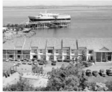
Red Lion Hotel, Port Angeles

See the October issue of the Knot News for additional information on this land cruise. Now is the time to