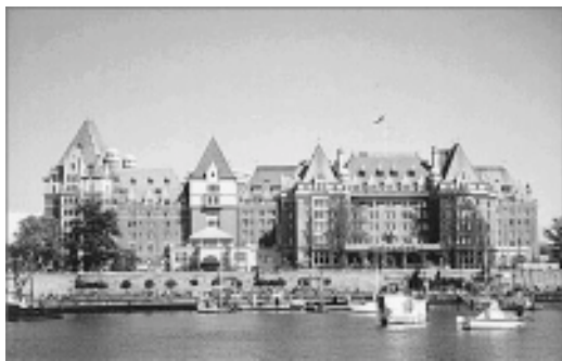
The Empress Hotel

Come join us for a Victorian Christmas in Victoria. Do your Christmas shopping, wander through