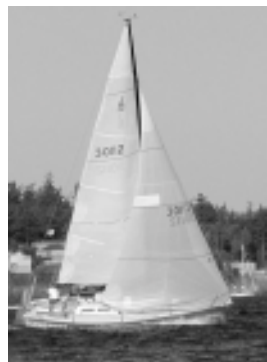
Slingshot Headed for the Windward Mark