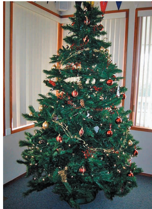
Come and See AYC's Tree